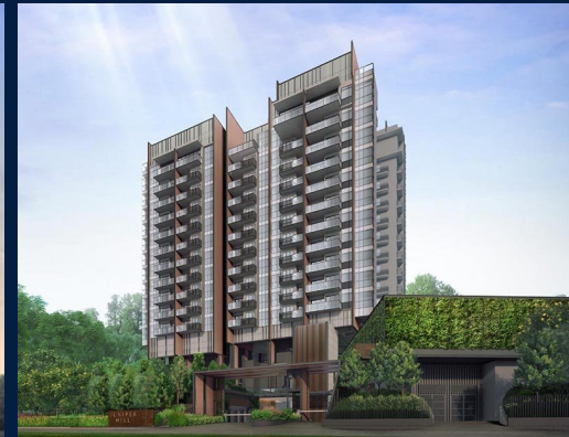
2 - Bedroom + Premium